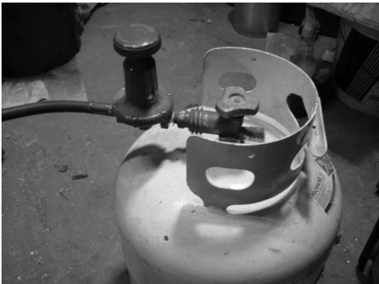
Here is a propane tank and an adjustable high pressure regulator is screwed into the valve with the propane hose extending to the left.

Only high pressure regulators will work with self-aspirated burners. And the regulator needs to be adjustable. The small regulator used on most gas grills will not work because they provide the propane at a low pressure (about 5 ounces). The pressures needed for these burners range from about 5 to 25 pounds (PSI).